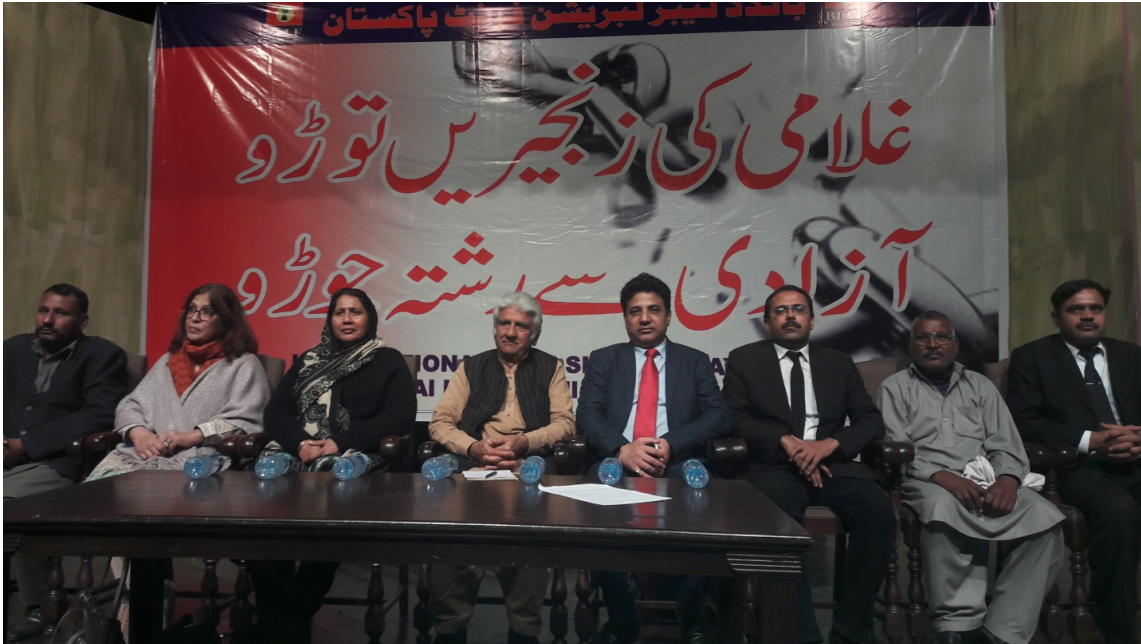
Dignitaries of the Seminar