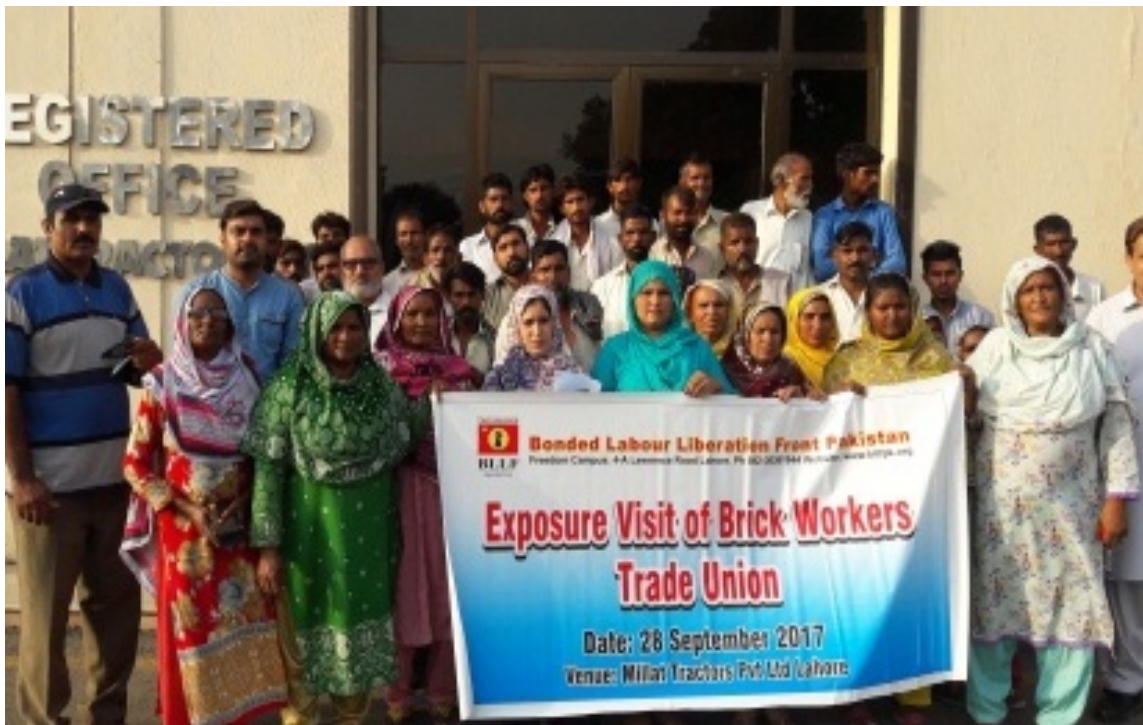
Visit to Millat Tractors Workers Union

break the shackles of debt bondage. In the 11 th month of project intervention workers unanimously established a cluster union of ten brick kilns in Sheikhpura which comprises off twenty-two members initially. Further cluster union has also applied for registration in labour department to get certificate. Beside it project staff has also build the capacity building of cluster union. For this BLLF's senior executives and staff contributed a lot. In this regard, the organization also arranged exposure visits for cluster union members. They visited well established trade unions. In exposure visits workers were sensitized about their role as union member and duty bearers too. Exposure visits provided opportunity to cluster union members to learn from senior trade unionists, e.g. how to unify voices of the affected communities, how to take up the issue to all concerned stakeholders. Now workers are unionized, active and identifying issues and taking up at relevant forums for solution.