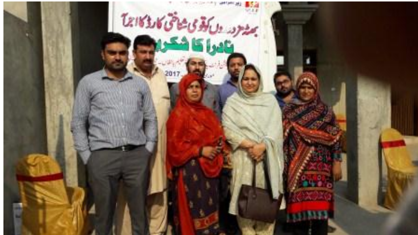
Group Photo of BLLF Staff and Nadra Staff