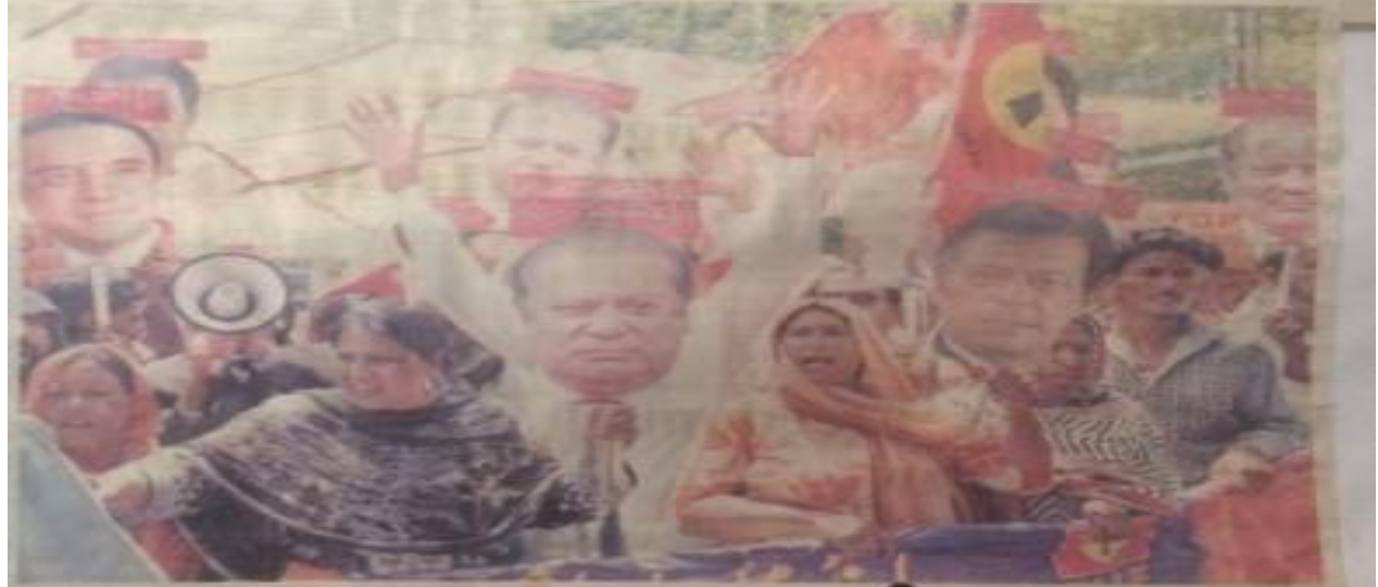
Rich kids workers hold a rally to support Labour Day. They hold the portraits of national leaders as they think all of them are responsible for their plight.