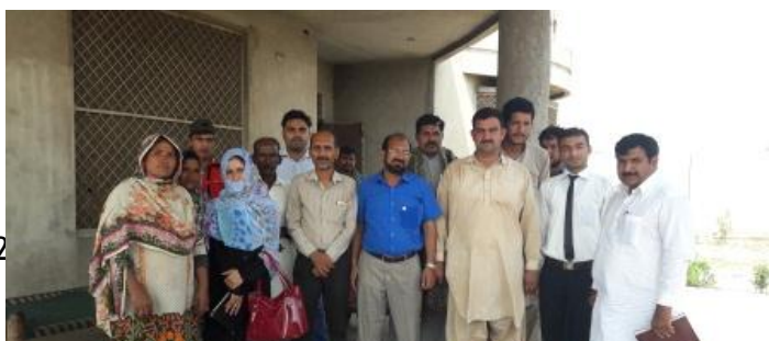
Facilitation committee meeting with employer of Sahoota Bricks Company

tool to save workers from bonded labour. Social security cards will help workers to overcome these unforeseen expenses and provide