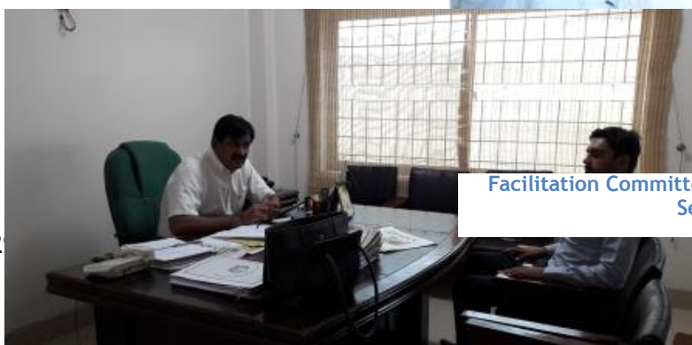
Meeting with Director Social Security Institution