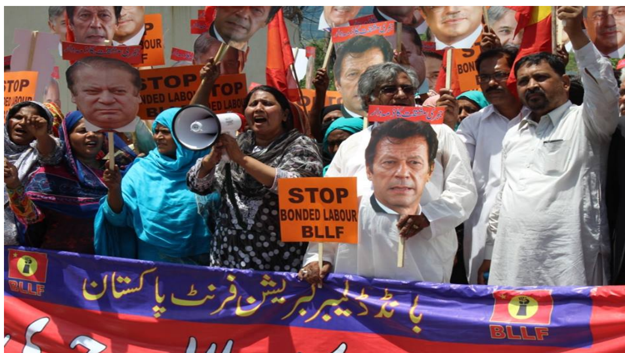
Participants of rally raising their voices in favor of brick kiln workers

tradition this year BLLF staged a massive rally from Press Club to Cheering Cross, The Mall Lahore on 1 st May 2017 to mark International Labour Day. Tens of thousands of Bricks kiln Workers, Trade unionists, political activists Parliamentarians, Government dignitaries, Civil Society, Bar Association, Doctors, Teachers, Lawyers, Media, and other sectors of the society participated in this event enthusiastically. Workers participated in rally with holding placards, banners and flexes which colored with slogans and demands of marginalized work force. Main objective of the rally was sensitization of concerned duty bearers to take proactive measures on violation of brick kiln workers labour and human rights. As well as putted over some demands and appealed to government for protection of labour rights, fair implementation on bonded labour system abolition act 2012, compliance of minimum wages award in brick kiln industry, combat child labour, living wages to brick kiln workers, protection of women workers rights, provision of legal entitlements including social security, EOBI, Khidmat card and social protection services.