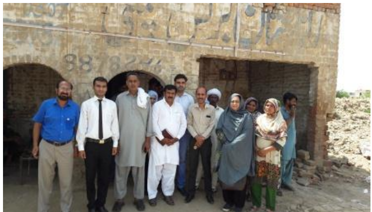
Meeting with employer of Rana Bricks Company

Low paid and out of social protection, brick kiln workers are compelled to take advances at the time of needs such as marriage, death, ailment, disability, childbirth, industrial accident etc. These advances trap them into the system of debt bondage. Hence provision of social security cards is the basic