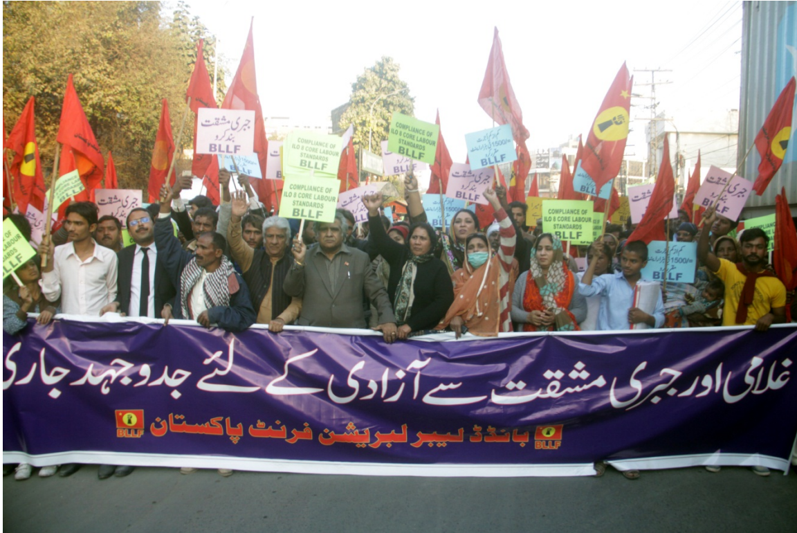
Rally to mark International Anti Slavery Day 2017