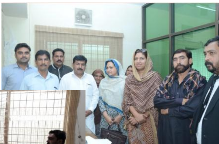
Facilitation Committee Meeting with Deputy Director Social Security Sheikhupura

For registration of workers project staff organized many meetings with Punjab employees Institution during reporting year 2017. Registration in social security